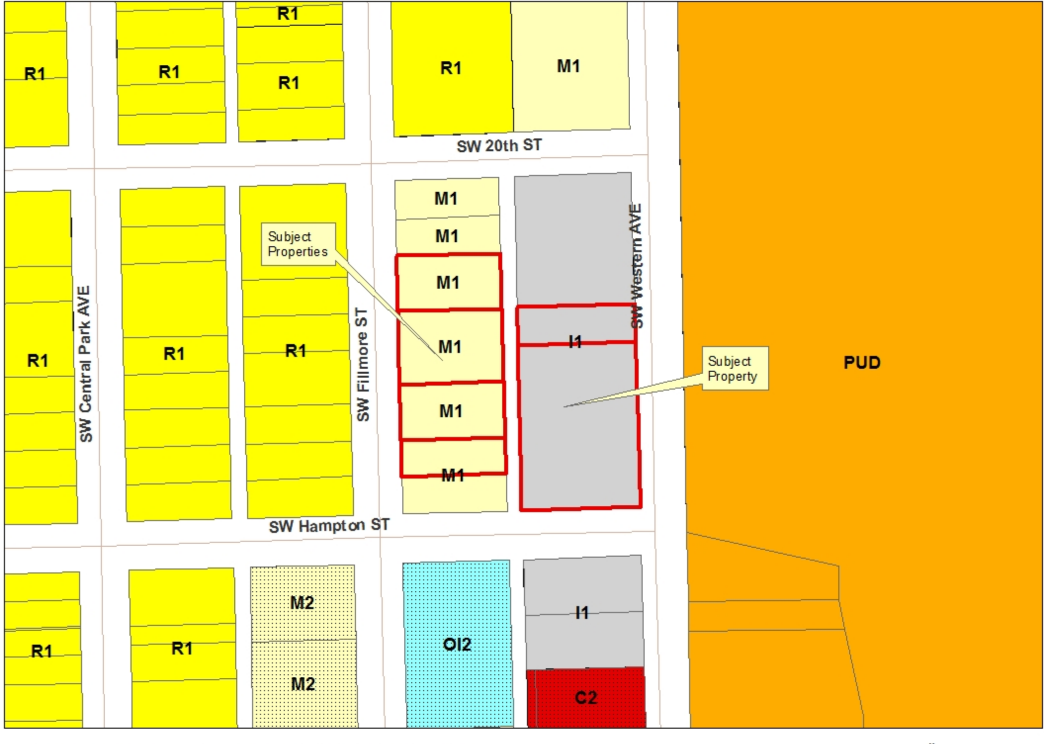
CU16/5 By: 901 Real Estate LLC