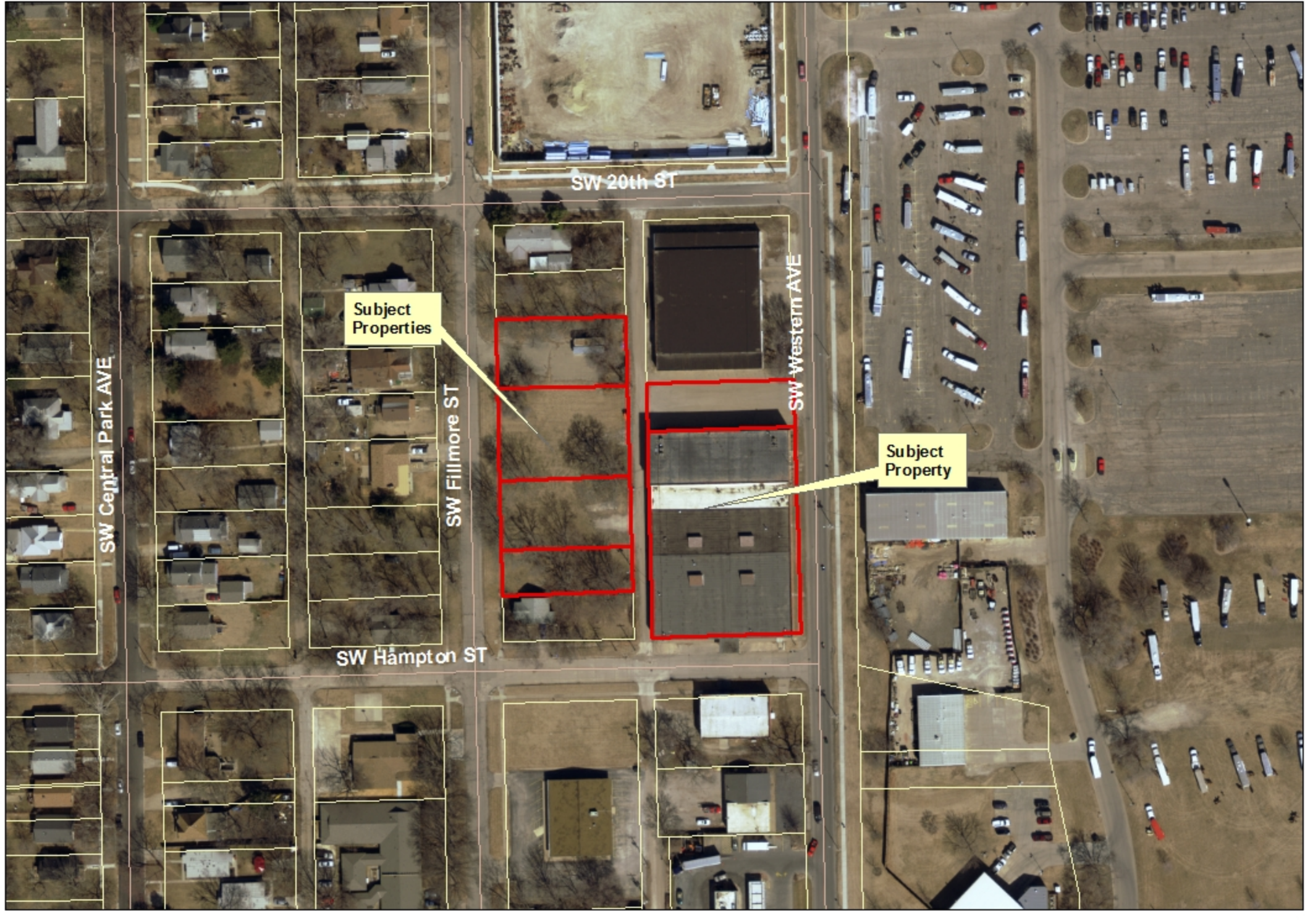
CU16/5 By: 901 Real Estate LLC