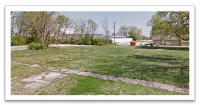
Fillmore properties adjacent to 2035 Western